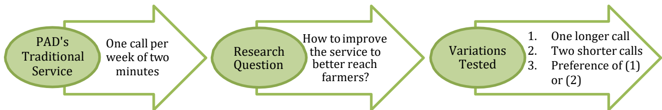
Figure 1. Framework for testing variations in PAD's traditional mobile-based outreach in Gujarat to better reach farmers.

Since 2015, PAD has been providing mobile phone-based agricultural advice in Gujarat, India. Monitoring user engagement over time, the team noticed that the listening rate seemed to drop for longer calls. To assess the effectiveness of the ongoing service, the team tested how farmers respond to different call frequencies and call lengths. Farmers may be unable to listen to longer calls made less frequently; however, they may also grow tired of more frequent attempts to contact them.